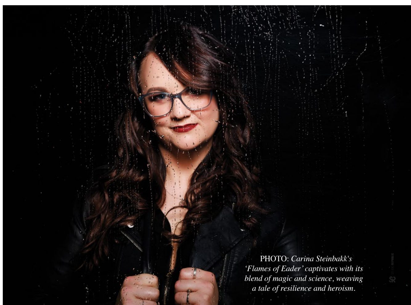
PHOTO: Carina Steinbakk's 'Flames of Eader' captivates with its blend of magic and science, weaving a tale of resilience and heroism.